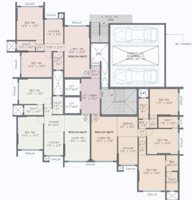
9TH TO 14TH FLOOR PLAN